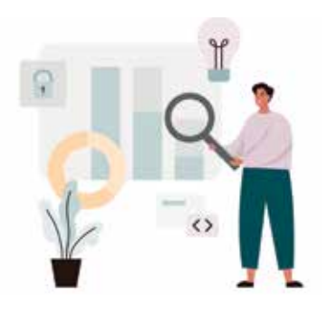
Custom services Programs created specifically to meet the unique needs of your population